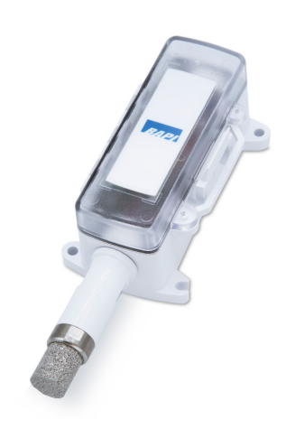
PHO1000 Humidity Sensor Outdoor Sensor