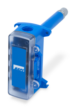
PHD1000 Humidity Sensor Indoor Duct Mount