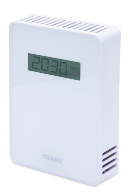
PC2002 CO2 Sensor Indoor Wall Mount