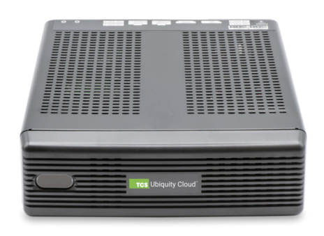
QD2040c Building Manager TCSBus & Modbus Communication

The US5182 is a highly versatile controller which can be programmed to accommodate a wide range of applications. Below are some of the most commonly ordered accessories (if you don't see an accessory to suit your specific application, contact TCS (800.288.9383):