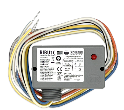
PR1121 Encased Relay SPDT, Manual Override