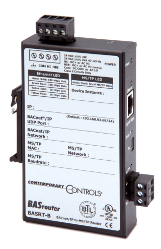
PI3100 BAS Router BACnet IP to MS/TP