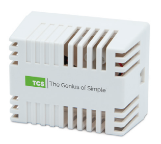
TS2000 Temperature Sensor Indoor Wall Mount