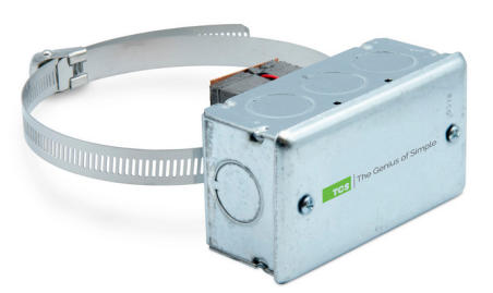
TS1005 Temperature Sensor Pipe Strap On