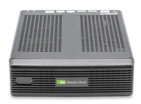
QD3041 Building Manager BACnet Communication