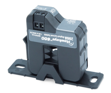
PS2001 Current Switch Split Core