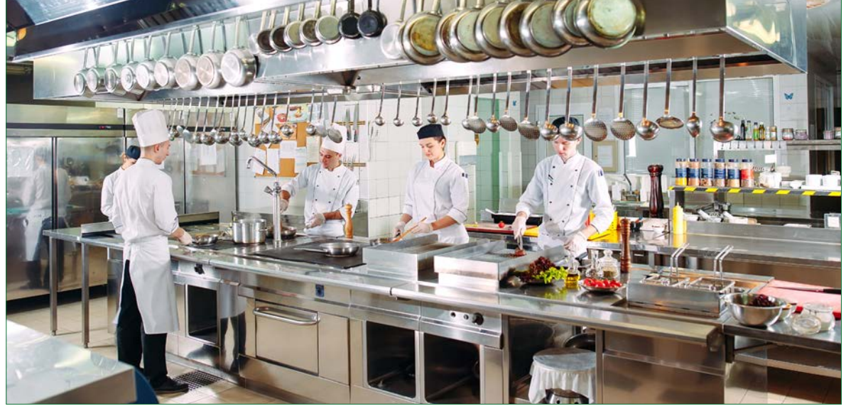
Use Ubiquity Cloud to manage kitchen lighting schedules

Early detection of restaurant equipment failures or operator errors (such as leaving a freezer door open all night) can save hours of downtime and thousands of dollars in repair and replacement costs. With Ubiquity Cloud, you can monitor your walk-in coolers and freezers in real time.