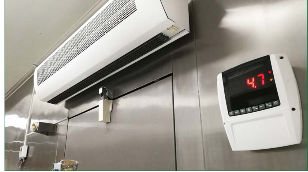
Monitor refrigeration systems to ensure fresh ingredients

Restaurants use up to 10 times the energy per square foot as other commercial businesses. On average, HVAC units consume 55% of restaurant energy usage. Refrigeration costs alone can account for as much as 6% of total energy costs.