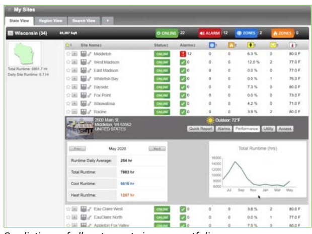
See listings of all restaurants in your portfolio