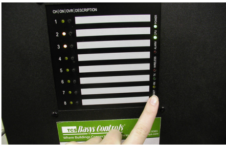
QWL 3.0 Reset Button